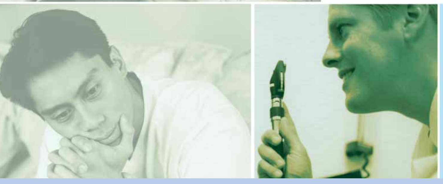
World Federation for Mental Health